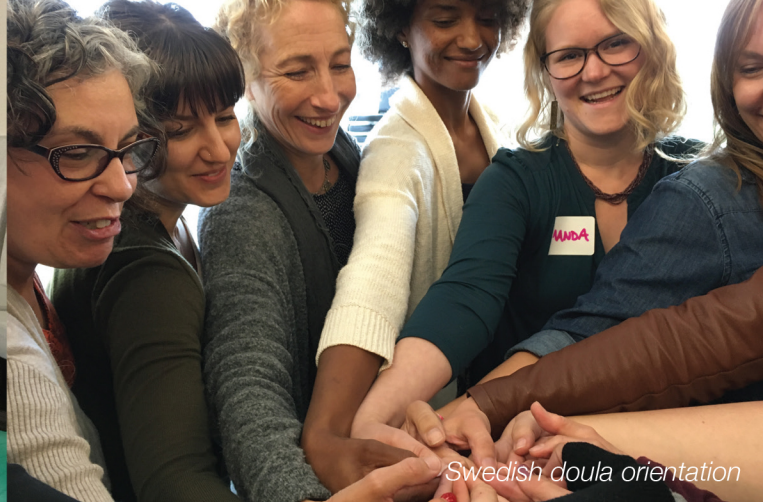
Swedish doula orientation